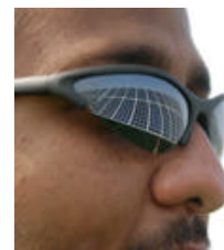
View to the future – “environmental friendly energy”

During the last months buzzing activity filled the lecture rooms of HPTI Hamburg Port Training Institute at the Overseas Centre in the Port of Hamburg. Fourteen environmental experts from Egypt and Syria, five ladies and nine gentlemen, met with tutors, lecturers and experts of environmentally-conscious companies and organisations. The foreign guests took part in a long-term training programme and used their time in Germany for study, for exchange of experiences and for constructive environmental-related discussions.