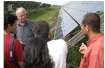
Meeting with environmental experts on site.

max.schwanitz@hpti.de or simone.teichert@inwent.org