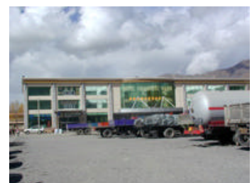
Cargo distribution centre in Lhasa.