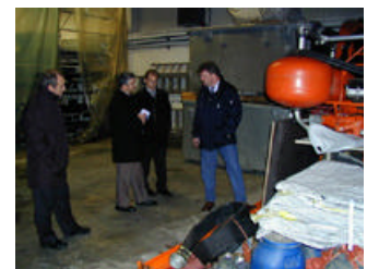
Inspecting spill combating equipment.