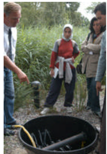
Site visit at a friendly environmental waste water treatment plant.