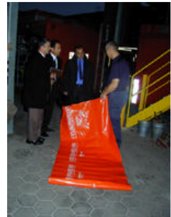
Discussing the properties of floating oil barriers.