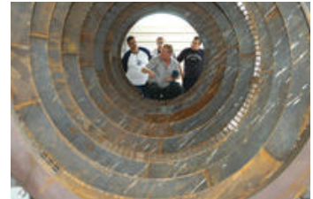
Information about newly -developed technologies.