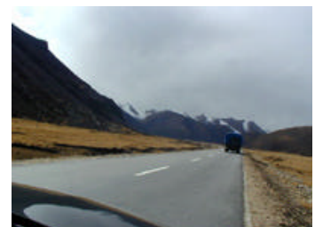
Mountain Highway in the Himalaya in about 4.500 m height.