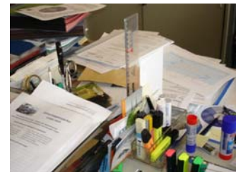
A cleared desk.

Tel.: +49 40 788 78-0 Fax: +49 40 788 78 178 Email: hpti@hpti.de Homepage: www.hpti.de