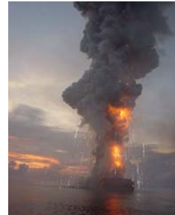
MS Hanjin Pennsylvania ablaze when undeclared Dangerous Goods containers self-ignited

On the practical side, the participants will learn how to use competently the IMDG Code and the other above-mentioned regulations, in particular concerning packing, labelling, storage, segregation, documentation and safety precautions. In a special "packaging laboratory", the participants will learn that dangerous goods are less dangerous when they are properly packed; in a special "cargo securing test bed", they will learn how important lashing, securing and shoring of dangerous goods is for safe transportation.