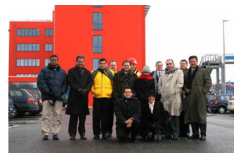
Visiting the container terminal CTA