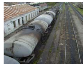
Oil transport in Caucasus