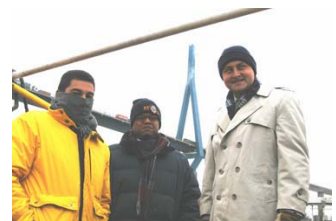
Visitors from the Caribbean and Central America happy despite the climate - in front of the Köhlbrand - bridge