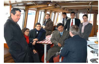
Exchange of information during a harbour cruise